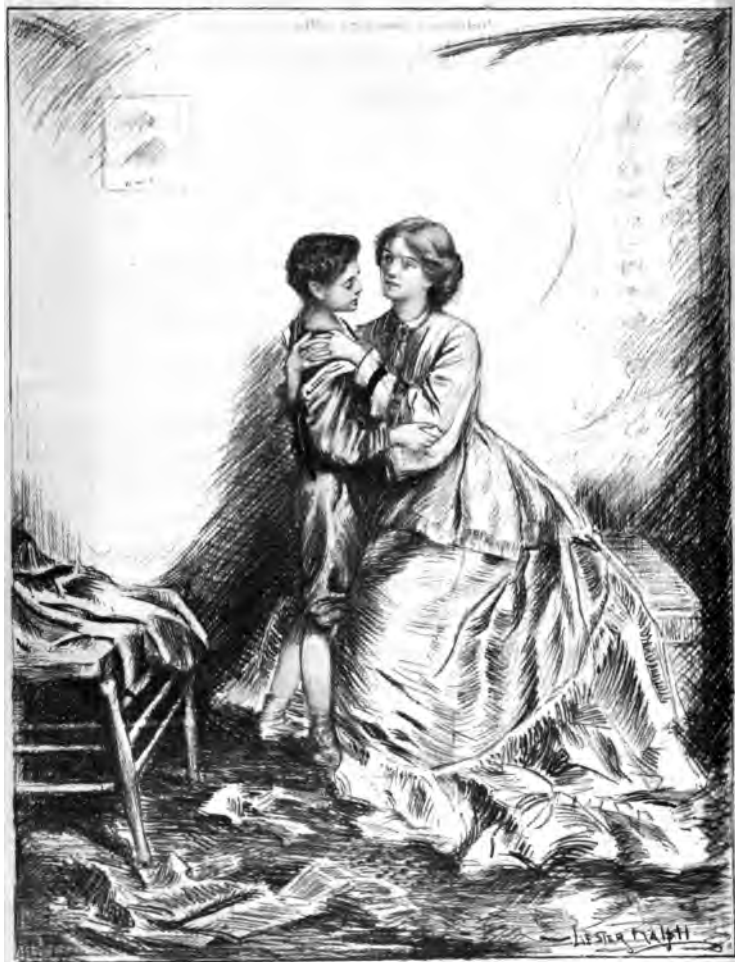
With a quick impulse she clasped him to her Page 15